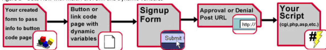
Figure 2 – Data Flow with Multi-Part Form and Dynamic Variables

The form you create will pass data entered by the consumer to the next form, which will then pass the variables to the EC Suite signup form. Upon completion of the transaction, data will be sent to the Approval or Denial Post URL.