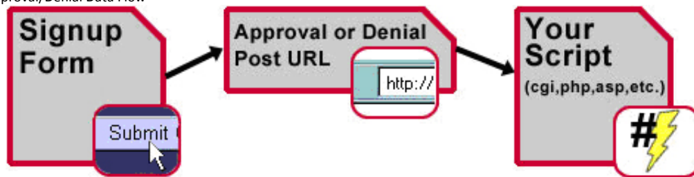
Figure 3 – Approval/Denial Data Flow

The next section discusses the variables accepted by EC Suite's system.